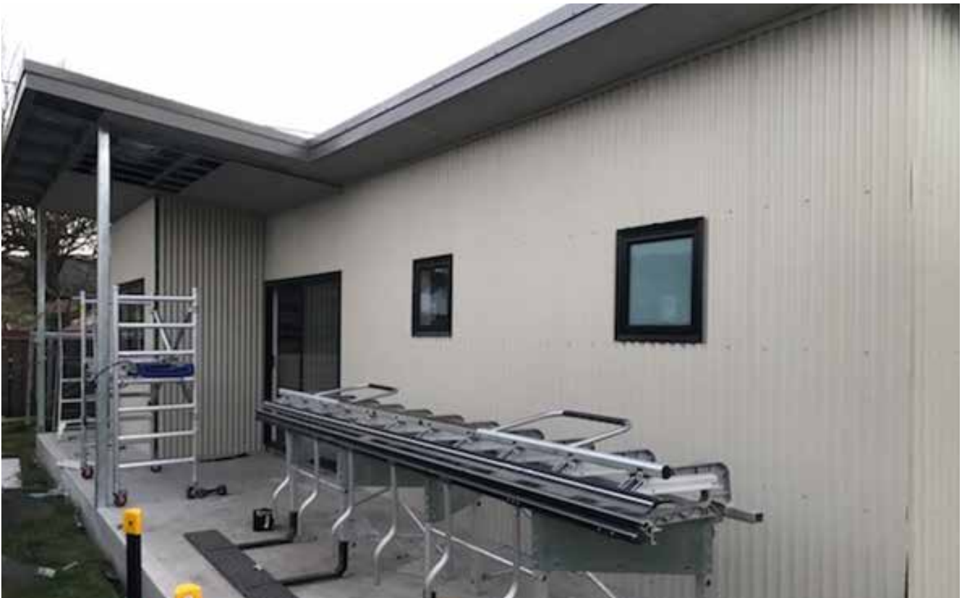
Custom Floorplan, Bathroom and finishing material choices by customer.