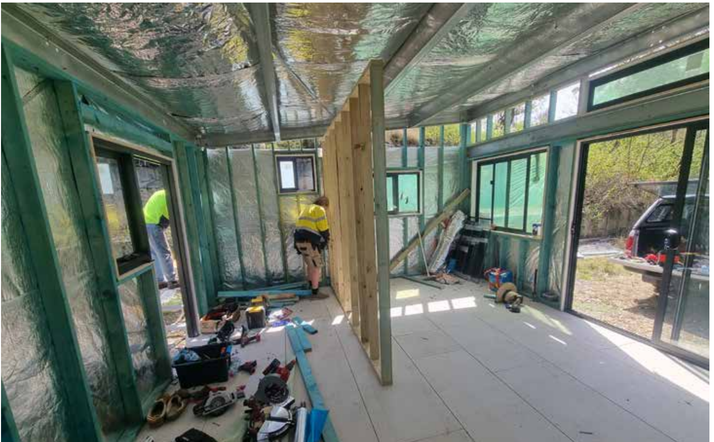
Supplied to home owner builder with support for local sub-trades