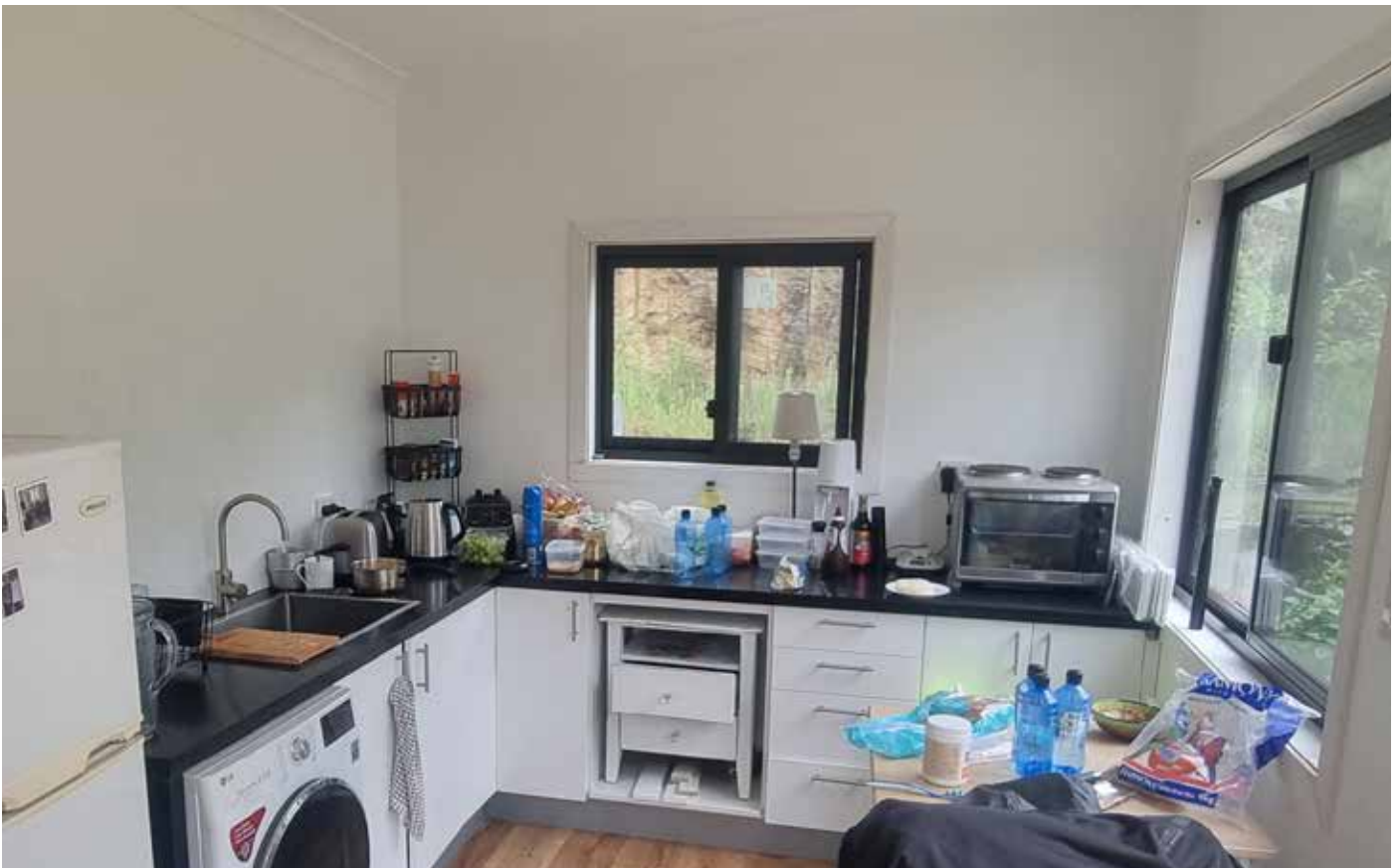
Custom Floorplan, Bathroom and finishing material choices by customer.