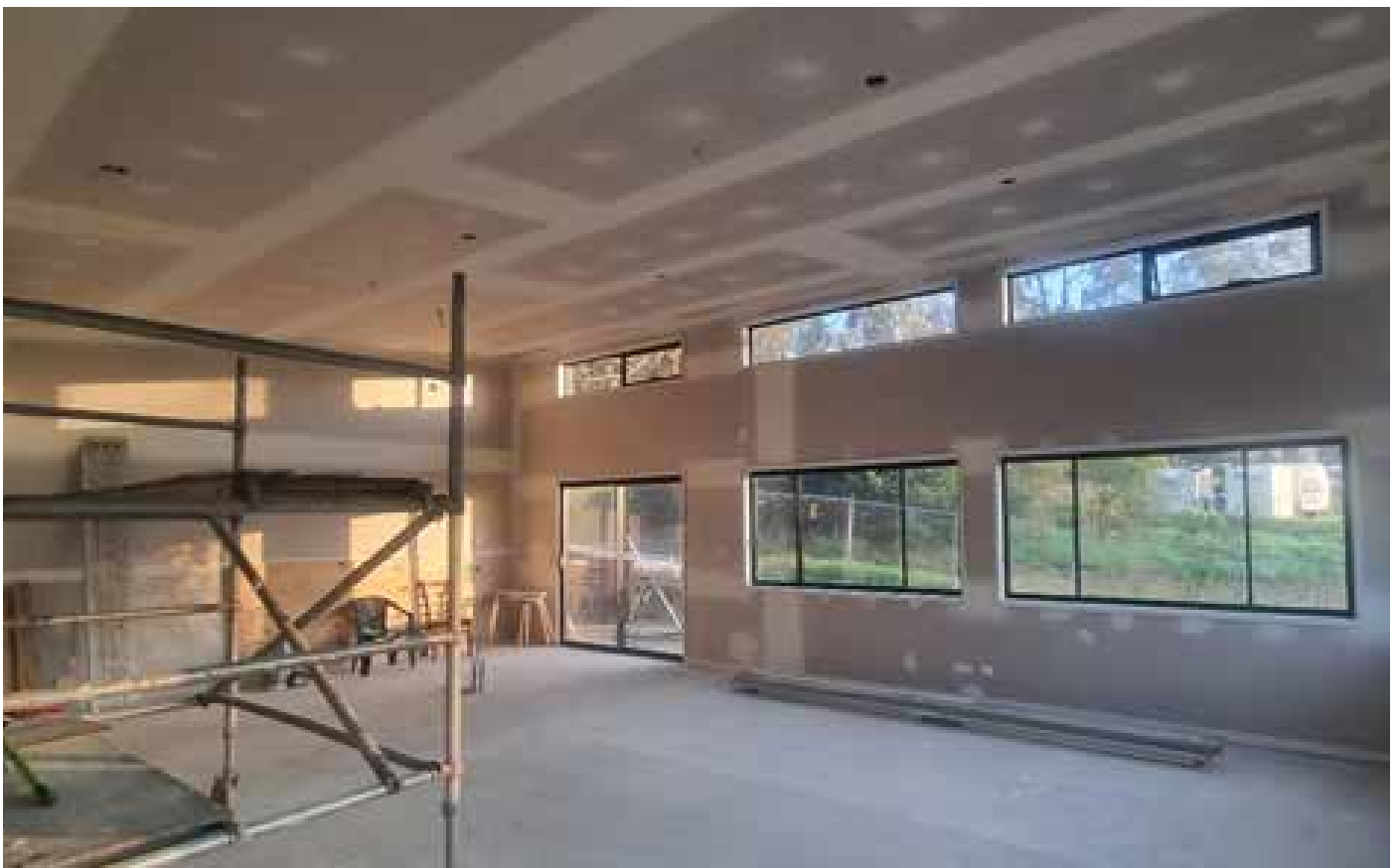
The BuiltQuik frame can be fit-out with various studwork materials, or infill wall panels.