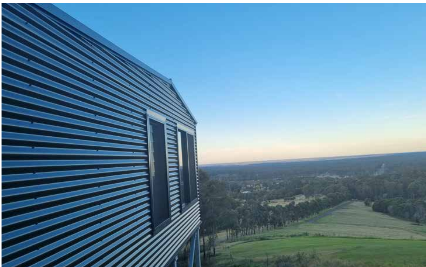
Homeowner Builder – Basic Studio Structure - finishing material choices by customer.