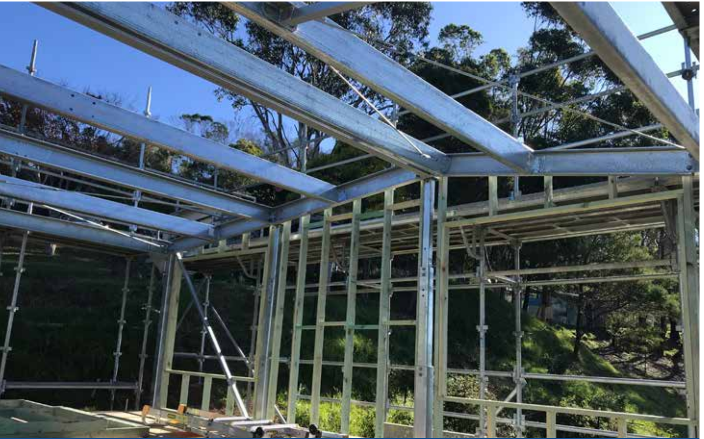
The BuiltQuik frame can be fit-out with various studwork materials, or infill wall panels.